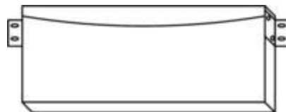
Astribank Wall Mount

Multiple Astribank units may be connected to a single Asterisk server using different USB 2.0 ports, a USB 2.0 hub or USB 2.0 PCI card.